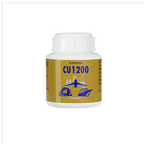
Item no. 810 800 Brush can 140 g