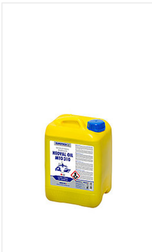
Item no. 821 005 Canister 5 Lt.