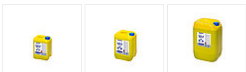
Item no. 821 005 Item no. 821 010 Item no. 821 025